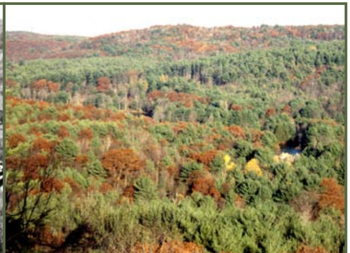
Swift River Valley, Massachusetts, ca. 1880's (left) and ca. 1990's (right).